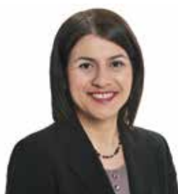
The Hon. Jenny Mikakos MP Minister for Families and Children