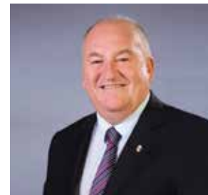
The Hon. Steve Herbert MP Minister for Training and Skills