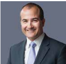
The Hon. James Merlino MP Deputy Premier Minister for Education

We believe that education has a critical role to play in the realisation of genuine reconciliation between Koorie and non-Koorie Victorians. Marrung will make a strong and positive contribution to this goal.